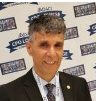
President of ADACI and CEO of ADACI Formanagement Srl