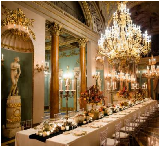
On the evening of Friday 22 September Palazzo Borghese will host the Gala Dinner organized by ADACI and IFPSM